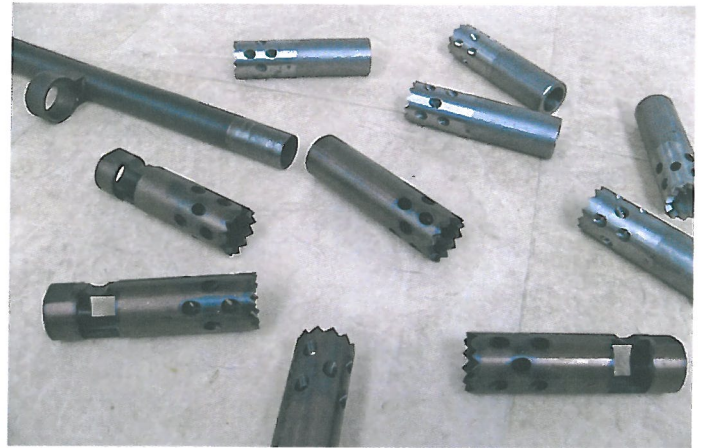
Helston manufacture 'Rakers' to suit all customers' needs, speak to our design team for a Raker to fit your special needs.