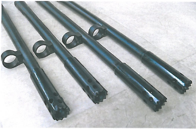
New barrels shortened with Rakers fitted.