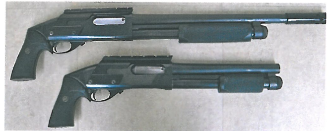
Specialist models designed to remain with the user when discarded (using the correct sling position), this is where size matters!