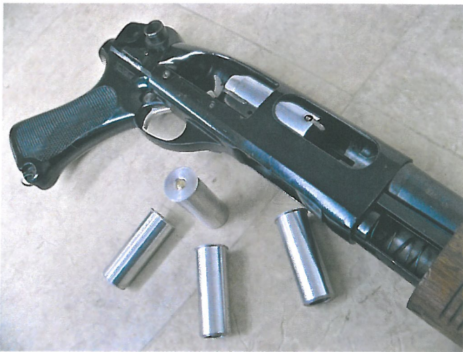
Understanding the function of the mechanism is basic training for the armourer who needs to identify faulty components.