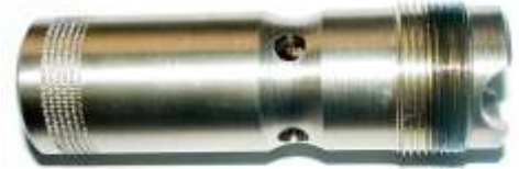
RIMFIRE/BLANK SLEEVE HOLDER CODE 76-056