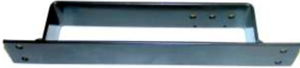
BODY HOLDER CODE 76-082