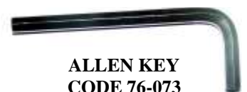
ALLEN KEY CODE 76-073