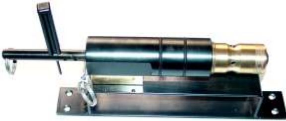
SHOTGUN/BLANK FIRING DEVICE CODE 76-052