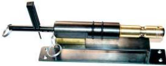
SMALL CALIBRE FIRING DEVICE CODE: 76-051