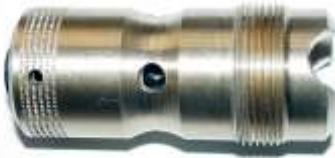
SHOTGUN SLEEVE HOLDER CODE 76-055