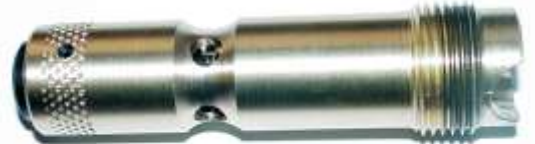
RIFLE SLEEVE HOLDER CODE 76-054