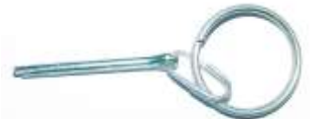
FIRING PIN RING CODE 76-072