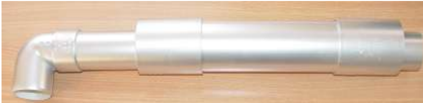
SILENCER TUBE SHOTGUN/BLANK CODE 76-084