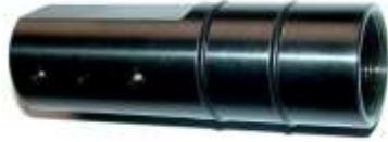
BODY SHOTGUN/BLANK CODE 76-081