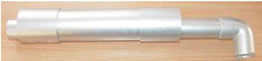
SILENCER TUBE CODE 76-083