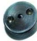
FIRING PIN DISC CODE 76-087