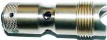
PISTOL SLEEVE HOLDER CODE 76-053