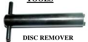
DISC REMOVER CODE 76-070